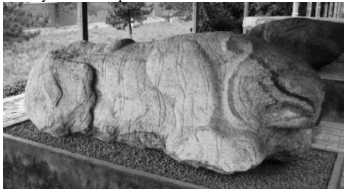
Fig.1 Mao ling Hue Tomb Stone Carving "The Stone Tiger" Western Han Dynasty

great prosperity of culture and the great development of sculpture. Ancient Chinese sculptures 54 developed into modern times, especially the integration of Chinese and Western cultures in the 20th century. The Western sculpture teaching system entered China, bringing China's sculpture modeling system into a new opportunity for development.